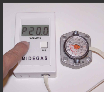
Displays gas volume in percentage

MIDEGAS Miguel Alemán #104 Int. 18 La Estancia Jesus Maria, Ags. 20994 MEXICO